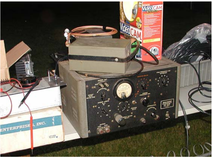
Whatever you were looking for—it was probably somewhere in the collection. Here is a low mileage sweep generator—just broken in.