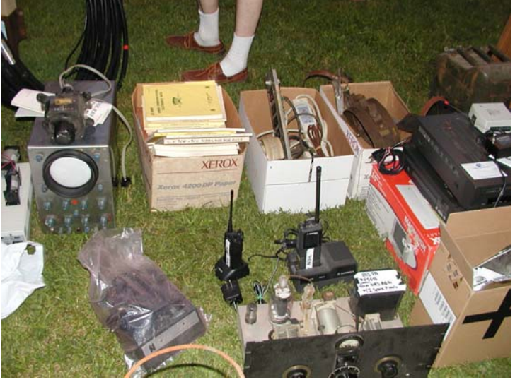
At this auction we have lots of collected knowledge in old manuals and equipment that will get you on the air on HF as well as goodies for up to 24 GHz. Here is a homebrew power amp built by PACKRAT WA3AQA Walt, plus a collection of test gear and handi-talkies too