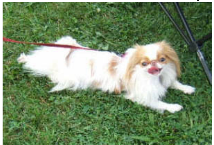
What would a picnic be without at least one animated vacuum cleaner. Looks like this little guy has been enjoying the fallout.