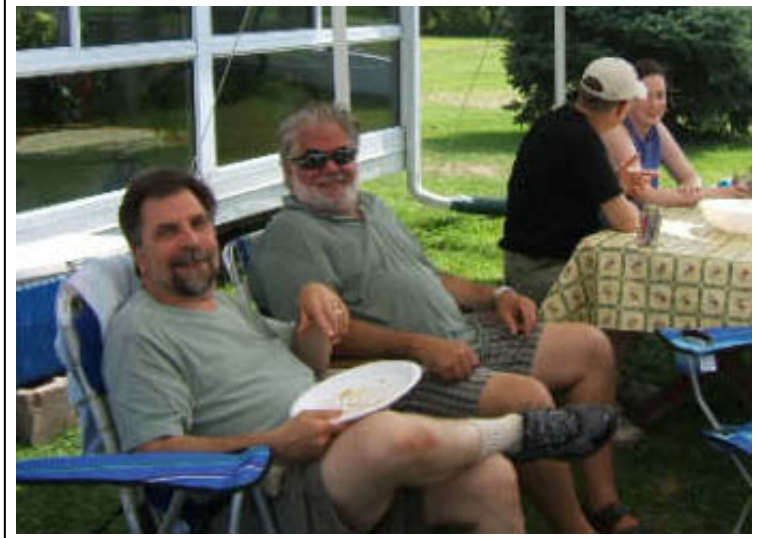
What doesn't fall on the ground goes to waist anyway. Here we have a couple of our more malnourished revelers demonstrating the clean plate techniques need to qualify for the dessert line—the author was right behind them on both counts.